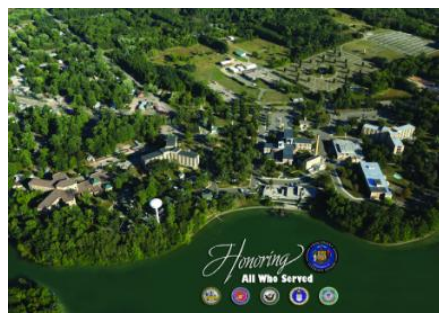
Wisconsin Veterans Home at King N2665 Cty. Rd QQ, King, WI 54946